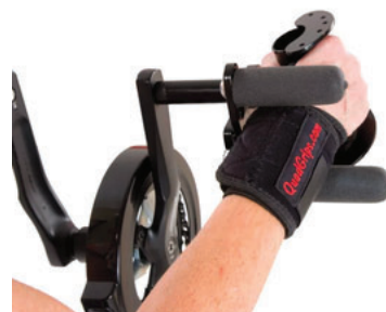
Quad Grip – help grip bike handle via (semi)rigid for pushing and pulling