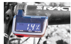
Digital Shifters – allows quads to shift safely