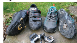
Various pedal straps and clip-in & clip-less cleats – for stabilization of feet and legs