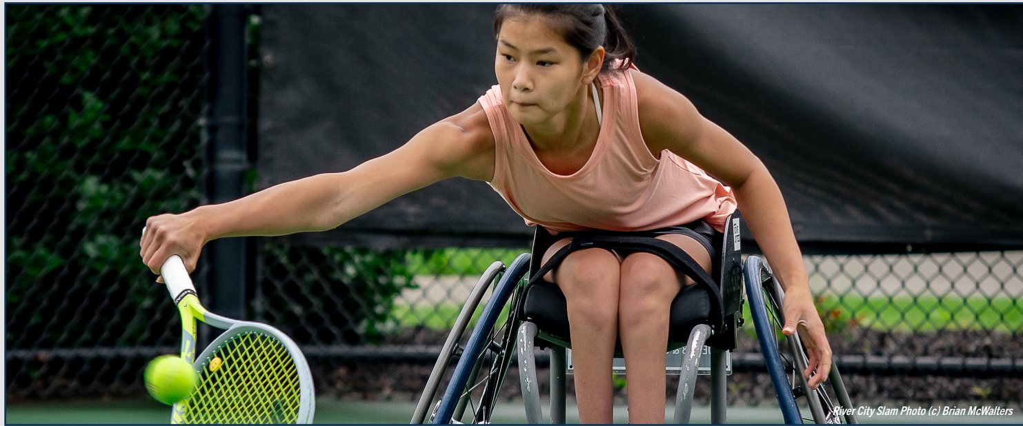
River City Slam